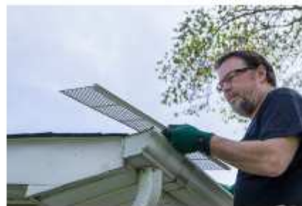
Prepare your home