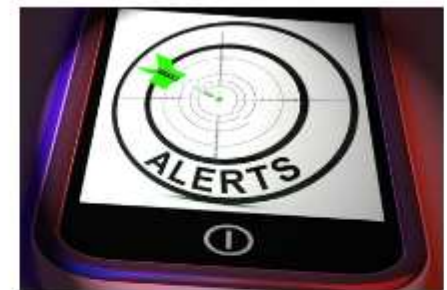
Sign up to alerts