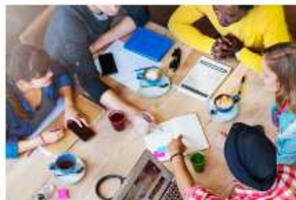
Prepare your community