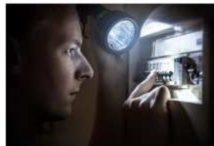
Report and prevent